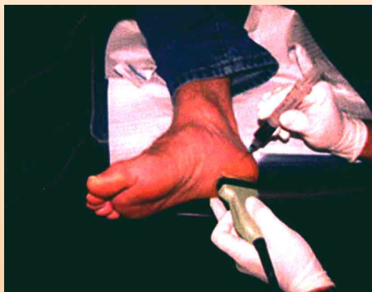
The posterior tibial and sural nerve blocks, one would inject APC+ from the medial aspect of the heel into the medial and central bands of the plantar fascia under the direct visualization of diagnostic ultrasound. This allows for a highly precise placement of APC+.

Successful tissue healing and regeneration requires a scaffold or matrix, undifferentiated cells and signal proteins and adhesion molecules (growth factors). It is well known that platelets affect mitogenic activity of cells like osteoblasts. 24