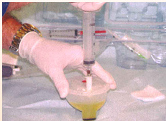
One would pull the yellow platelet poor plasma (as seen above) off the platelet "pellet." Then you would mix the remaining platelets with a small amount of the platelet poor plasma to create the autologous platelet concentrate (APC+).

The use of autologous platelet rich plasma is not a new treatment. 21 The healing cascade, which is the physiological response to any injury or surgical intervention, is well documented and relies on proteins that are delivered to the healing site by platelets and white blood cells in addition to those proteins that are present in the plasma. 22, 23